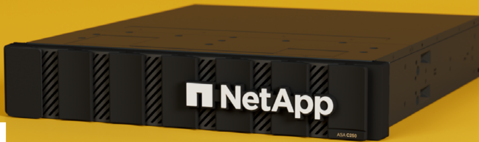
Table 2. ASA C-Series technical specifications